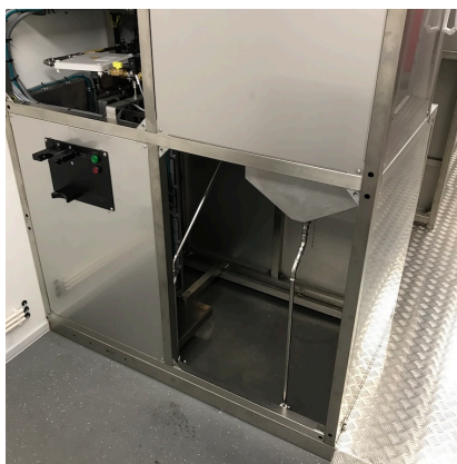
Figure 2 - Access to water reservoir